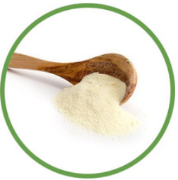
Powdered milk 20g - 100 cal