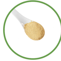
Protein powder 20g - 73 cal