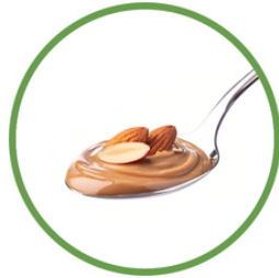
Almond butter 20g - 131 cal