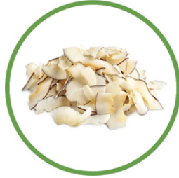
Toasted coconut 20g - 100 cal