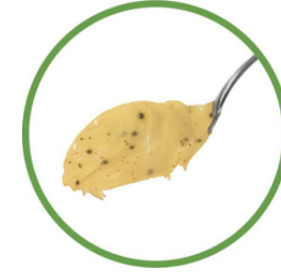
Passion fruit cream 20g - 53 cal