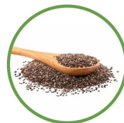
Chia seed 20g - 109 cal