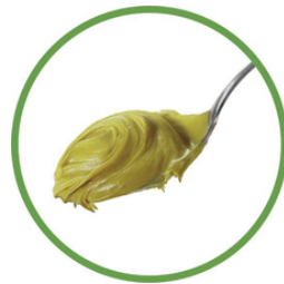
Pistachio cream 20g - 114 cal