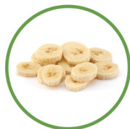
Banana 20g - 19 cal