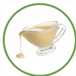
Condensed milk 20g - 67 cal