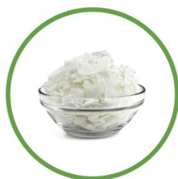
Shredded coconut 20g - 130 cal