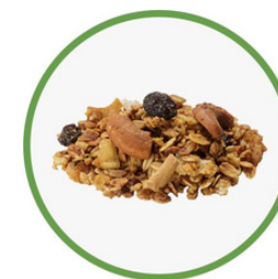
Granola (gluten free) 20g - 80 cal