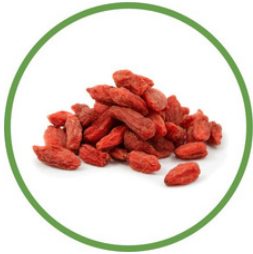
Goji berry 20g - 70 cal