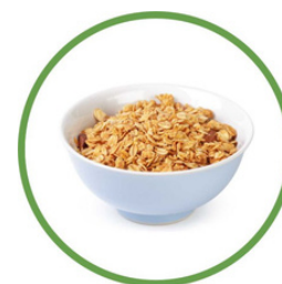
Granola 20g - 82 cal