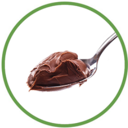
Nutella® 20g - 108 cal