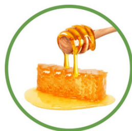
Honey 20g - 60 cal