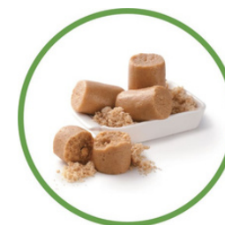
Peanut butter crumble (paçoca) 20g - 94 cal