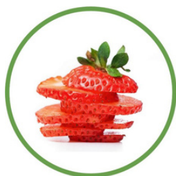
Strawberry 20g - 6 cal