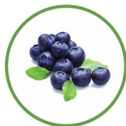
Blueberry 20g - 6 cal