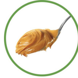
Peanut butter 20g - 116 cal